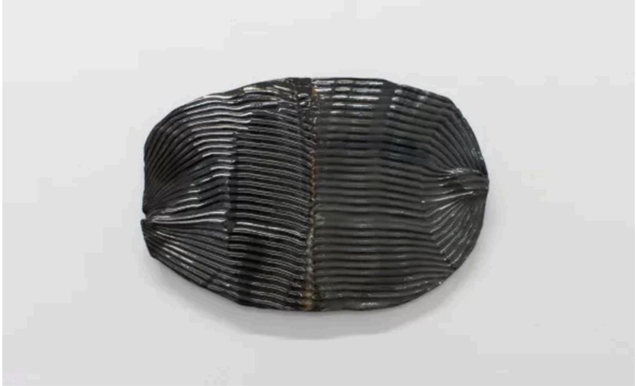
Nicole Ondre Shell 1 , 2018