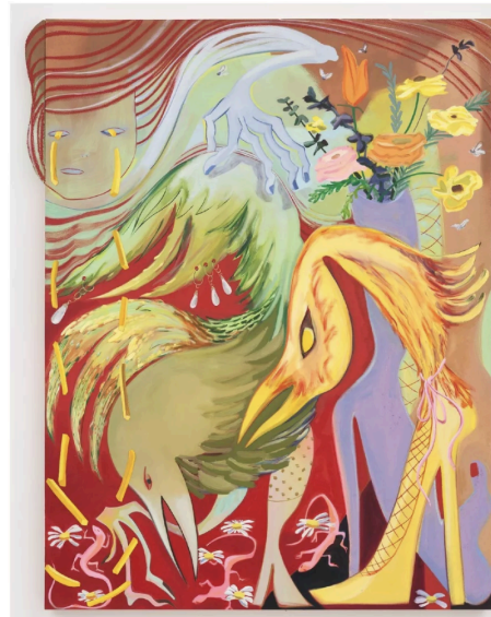
Chelsea Culprit Polite Poultry Fight Swayed by Wendy's Windstorm , 20... SECRET | BEACH Price on request