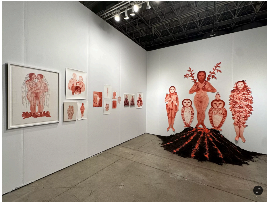
Odonchimeg Davaadorj, installation view in re.riddle's booth at EXPO Chicago, 2025.

This preference for emotionally resonant work carried over to San Francisco-based re.riddle, which made its EXPO debut with a presentation by Paris-based Mongolian artist Odonchimeg Davaadorj. With prices ranging from $800 to just over $6,000, the booth included red watercolor works on paper and a commanding installation: five large-scale, red-toned figurative cutouts depicting a nude woman, flanked by two owls and two shorter figures, set above a mound of red-streaked dirt. The result was raw, symbolic, and a refreshing approach to a booth presentation.