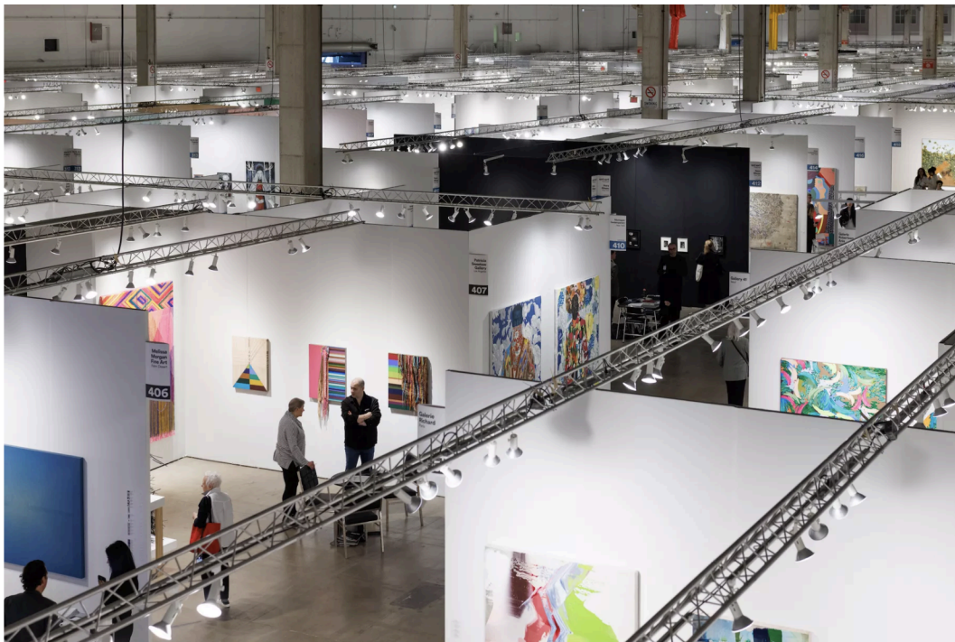
Interior view of EXPO Chicago, 2025.