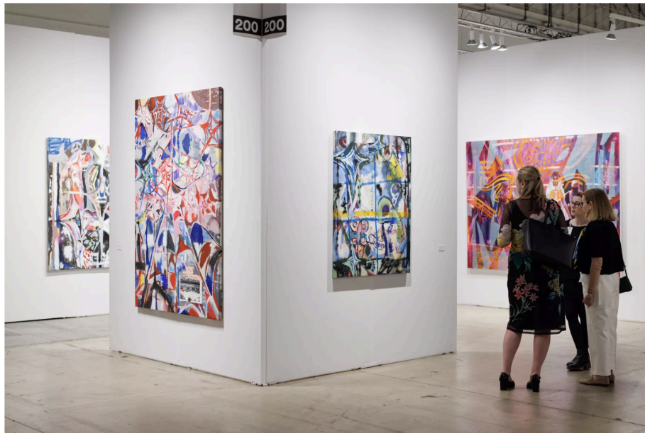
Installation view of Bockley Gallery's booth at EXPO Chicago, 2025.

The 12th edition of the fair, on view through April 27th, is the second held under the ownership of art fair conglomerate Frieze, which is largely seen in the changes to EXPO’s programming. Most notable at this year’s edition are the 20 Korean galleries participating in a special collaborative program with the Galleries Association of Korea (GAoK). The initiative draws on the synergy between Frieze’s Seoul fair and its concurrent neighbor KIAF Seoul, adding a global dimension to the fair’s typically regional foundation.