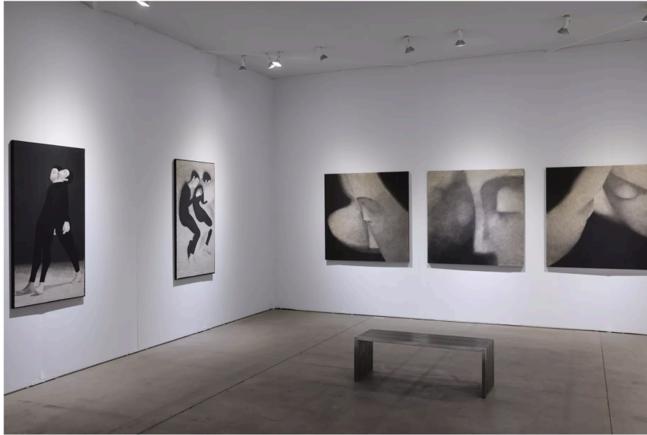
Moonassi, installation view in EVERYDAY MOONDAY's booth at EXPO Chicago, 2025.

“[These artists] want to highlight that not everything you experience has to be good,” Kim said. “It’s like how light and dark work—because there are dark moments, you come to appreciate the light, and vice versa.” That sensibility was especially present in Lee In Seob’s Untamed: grains of time (20250212) (2025), the most expensive piece in the booth, priced at $65,450, which layers gestural strokes of cobalt blue and taupe over a textured white ground, evoking a meditative tension between contrast and calm.