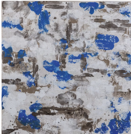
Lee In Seob Untamed; grains of time (20250212) , 2025 Suppoment Gallery US$65,450